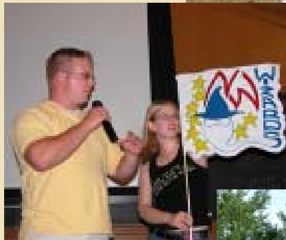
"SLI was a very worthwhile experience. I wish I could do it again."